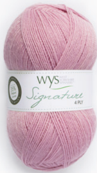
Sweet Pea 517