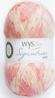
English Rose 806